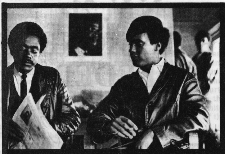
July 1967--Minister of Defense, Huey P. Newton (right) and Chairman, Bobby Seale (left), reading an early edition of B.P.P. Newspaper at the home of Eldridge Cleaver, Minister of Information B.P.P.

Huey would say, "a newspaper is the voice of a party, the voice of the Panther must be heard throughout the land."