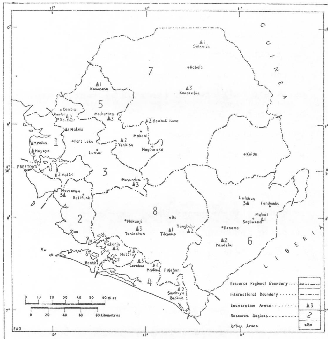
FIGURE 2.1 SIERRA LEONE RURAL RESOURCE REGIONS