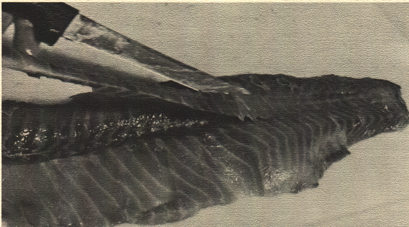
3. Fillet and skin the fish, then trim the lateral lines as shown here.