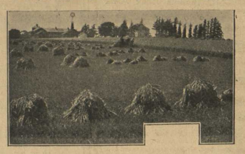
FOR WHEAT, FOLLOWED BY ALFALFA Fertilizer for wheat to be seeded to alfalfa or clover should be high in phosphate, fairly high in potash and have enough nitrogen for the wheat. Nitrogen should be quickly available for the wheat.