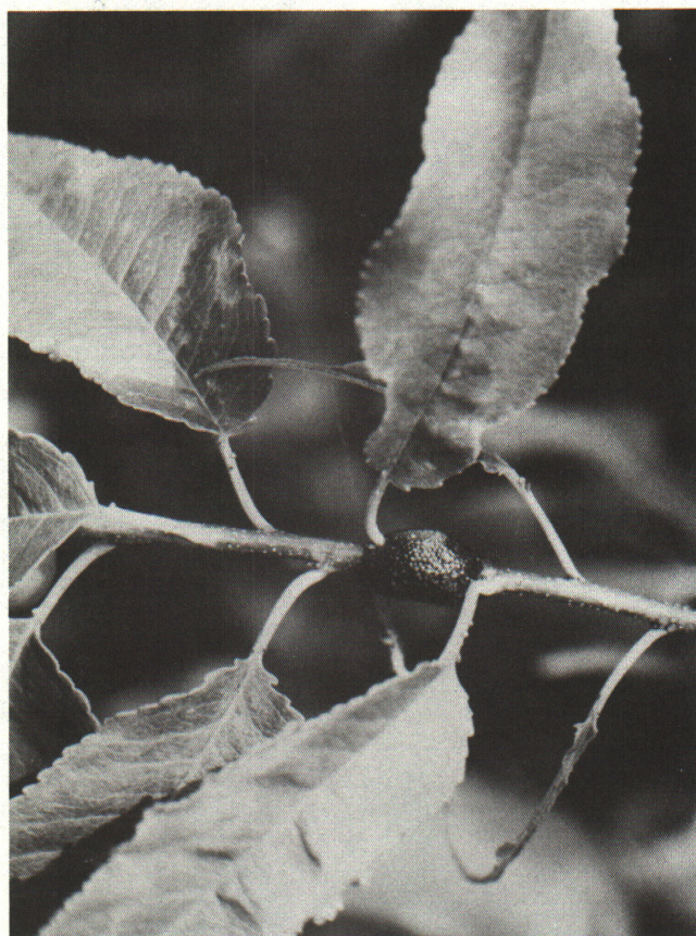
Egg mass on twig (mid-summer).

LIFE CYCLE. Eggs are laid on twigs in mid to late June and overwinter in this stage on the tree. Larvae hatch from the eggs at bud break in mid to late April (April 10-20) and immediately begin spinning a silken tent. The newly hatched larvae initially feed on opening buds and subsequently concentrate on the new foliage as it becomes available. Larvae leave the tent to feed at various times of the day returning only to rest. As larvae begin to mature at the end of May and early June, they leave the tent and seek out protected areas to form pale yellow cocoons. It is during this time that many people observe these large caterpillars wandering about their yards or climbing sides of buildings, fence posts, cars, etc. However, since little or no feeding occurs at this time, no controls are necessary. Adult moths emerge in 10-14 days to mate and lay eggs.