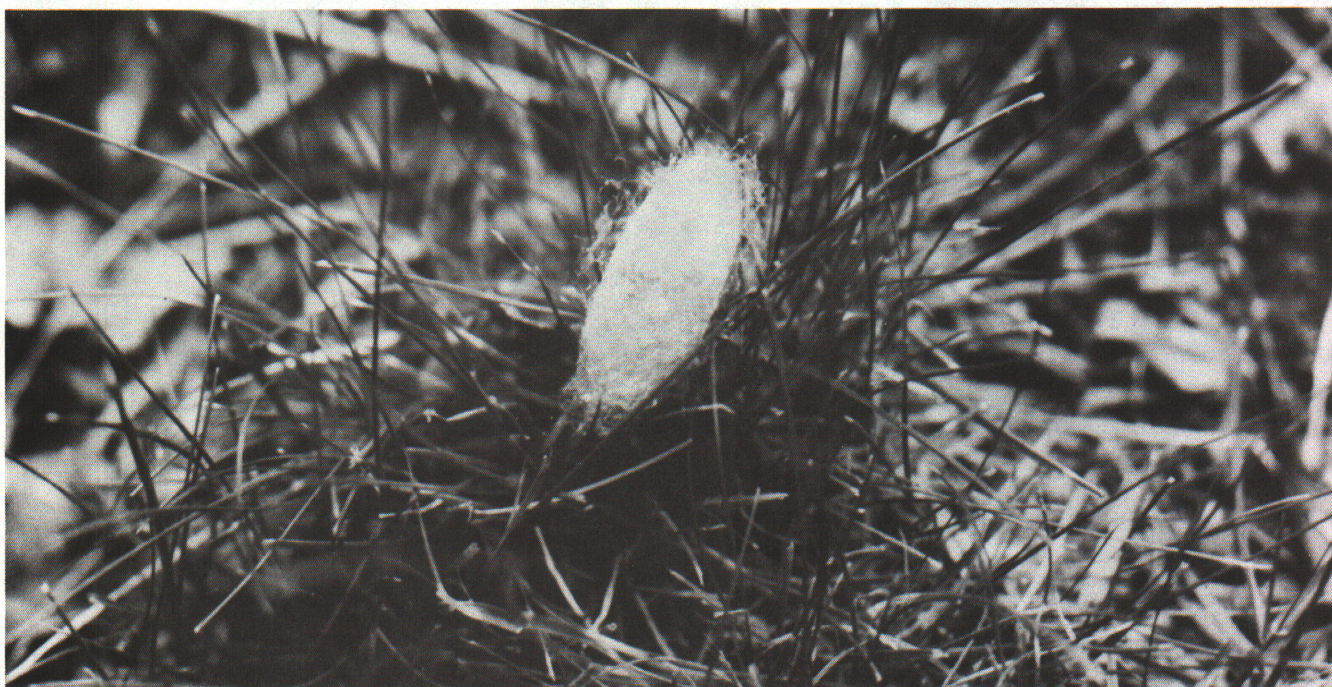
Pale yellow cocoon of the eastern tent caterpillar on tuft of grass (late May-early June).