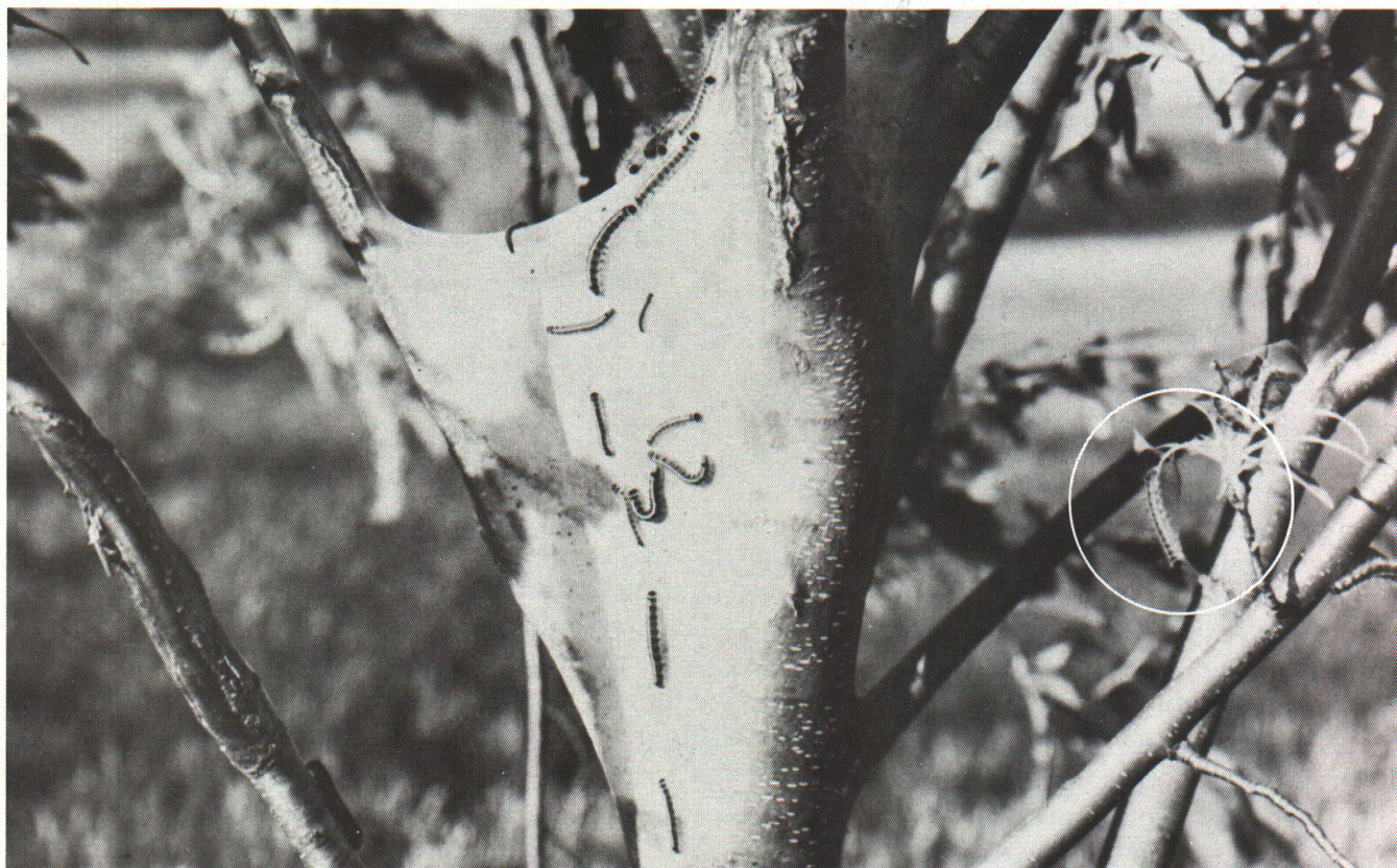
Eastern tent caterpillar in fork of tree (late April-late May) with caterpillars moving from tent to feed.

Eggs: ETC eggs are deposited in a band around small twigs or branches and covered with a foamy brown substance which hardens into a mass. The egg masses are 10-20 mm ( \frac{1}{2} - \frac{3}{4} " ) long with approximately 90 to 220 eggs per mass.