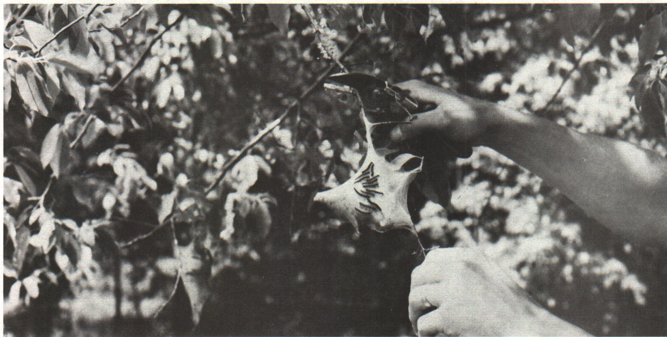
Small tents can be removed with pruning shears or by hand and destroyed.