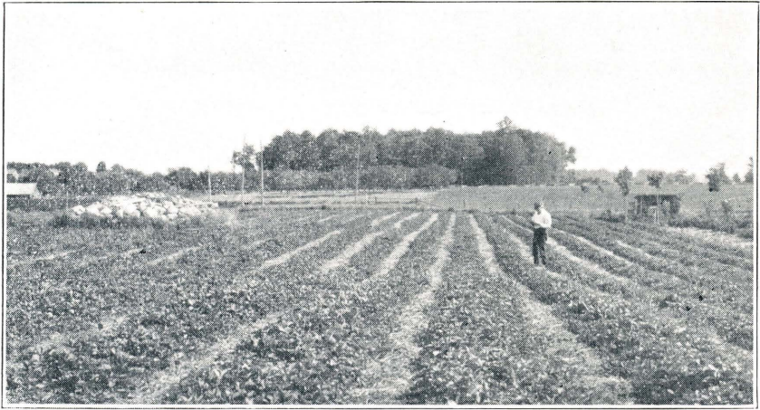
Fig. 1. A field of Dunlap strawberries near Fremont, Mich. Note the gently sloping site which insures good air and water drainage.

lands. For late varieties, northern exposures or well drained bottom lands are preferable since they are cooler, more moist, and, hence, more productive. In sections bordering on Lake Michigan, an exposure toward the moist moderating winds from the lake is always desirable.