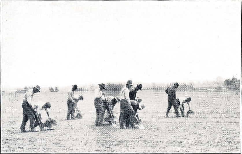
Fig. 3. Transplanting with spades on a well prepared soil. Note the plant carriers used and that the field has been marked off both ways.

Setting is usually done by hand, one man dropping the plants for two setters. The plants should not be dropped far in advance of the setters. On the lighter soils which have been well prepared, the holes may be made with the hands but, on the stiffer soils, a trowel, dibber, or spade is commonly used. Sometimes a shallow furrow is run up the row and the plants set along the land side of the furrow. Whatever method is used, it is important that the roots be well spread and the soil pressed firmly against them. There is little danger of making the soil too firm unless it is wet. Loose setting is a frequent cause of failure. A little loose soil should finally be left over the surface as a mulch. After the soil has settled, the crowns of the plants should be even with the surface. If a plant is set too deeply, especially on heavy soils, the crown becomes covered and rots. If not set deep enough, the roots become exposed and dry out.