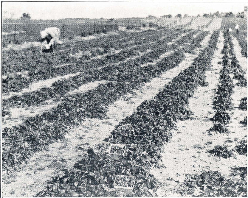
Fig. 6. Harvesting everbearing strawberries. Note the overhead irrigation system on the left.

Everbearing strawberries differ from the standard or June-bearing varieties in their bearing fruit more or less continuously throughout the summer and fall instead of maturing the entire crop within a period of three or four weeks. They are especially desirable for the home garden and under favorable conditions may be profitably grown as a commercial crop. However, the everbearers are not recommended for general commercial planting in the state. More care and better cul-