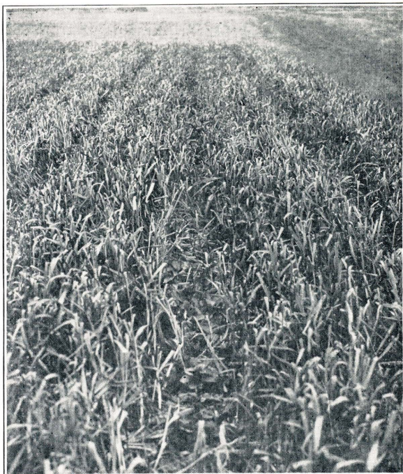
Fig. 4. Fall oats grown as a mulch crop between the strawberry rows. This should be supplemented with a light covering of straw over the rows.

not need to be disturbed, but if it is several inches in thickness it should be parted or opened over the plants, and any surplus material removed and pushed into the alleys between the rows. This mulch should be left on the patch until the end of the harvesting season. When removing the mulch from over the plants, one should leave as much as possible around the base of the plants to keep the berries clean and conserve moisture. Opening of the mulch should be delayed as long as possible in the spring to help retard blossoming, and thus prevent possible damage from late frost, and to smother weeds. However, severe damage may result if the mulch is left too long. The plants should be examined frequently, especially if the weather is warm, and