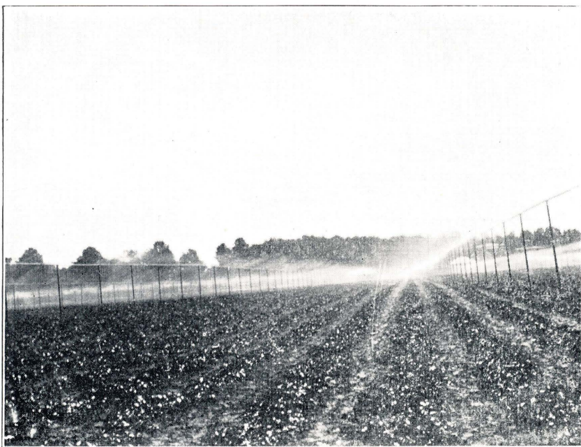
Fig. 5. Overhead irrigation is an insurance against drouth and also may be used for warding off light frosts during the blossoming season.

or no benefit will be derived from irrigation, while the yields obtained in other seasons may be several times greater than those obtained on a similar soil without irrigation.