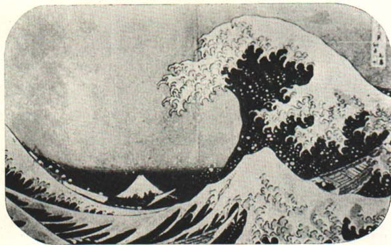
"The Great Wave"—Hokusai

Do not think of pictures merely as beautiful wall decoration, but choose those that make your surroundings happier and your ideals higher. Choose pictures that are worthy of continued notice. Use only a few pictures in a room at a time.