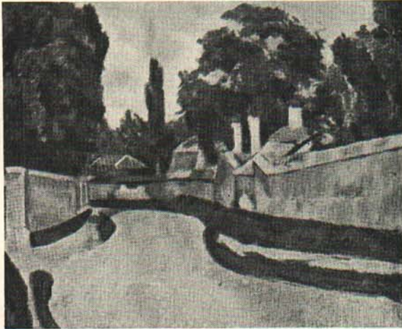
"The Village Road"—Cezanne

advantage if it is hung so that the center of interest in the picture is on the eye level of the person viewing it. This height is usually reckoned as being five feet three inches from the floor. The height for pictures in the child's room should be adjusted to the height of the child.