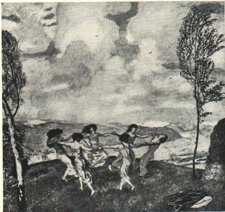
"Spring Dance"—Von Stuck

The Japanese, who have been trained to enjoy beautiful art, have an interesting method of using pictures in a room. Only one picture is used at a time and this one is given the place of honor. After a time, this picture is taken down and a different one used in its place.