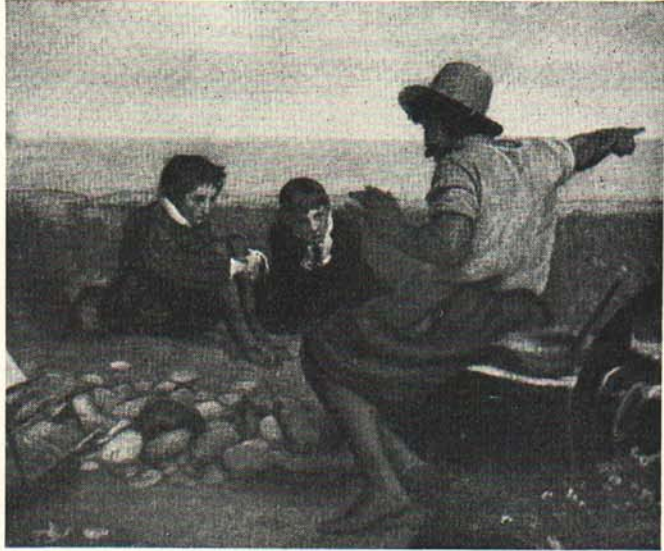
"Boyhood of Sir Walter Raleigh"—Millais

Another means of enjoying a picture is to see the beauty that the artist saw when he created it. Pictures are windows into the world of beauty that the artist knows. This beauty is often in color. When someone once said to the great artist Turner, that he had never seen such colors in nature, Turner replied, "Don't you wish you could?" A search for this same color in nature will be rewarded by the opening of a new world of beauty.