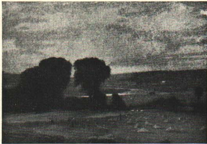
"Peace and Plenty"—Inness

that their size and shape will be similar to the size and shape of the wall space where they are to be hung. A horizontal, rectangular picture of considerable size is best suited to the space above a davenport which is against a long wall or over a fireplace. Vertical flower panels may be hung in the narrow wall space on either side of a group of windows.