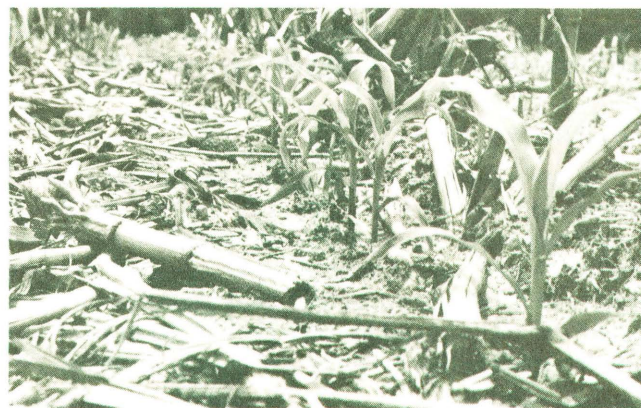
No-till corn planted in heavy corn stubble.

Anhydrous ammonia has been successfully used in the no-till system and will reduce the need for frequent liming because it is incorporated rather than surface applied. Applicator knives should be equipped with rolling coulters ahead of each knife and a packer wheel behind to prevent escape of ammonia from the slit made by the knives. Applying urea or 28 percent nitrogen (50 percent urea) solution to crop residues may also result in sizable losses of nitrogen by ammonia