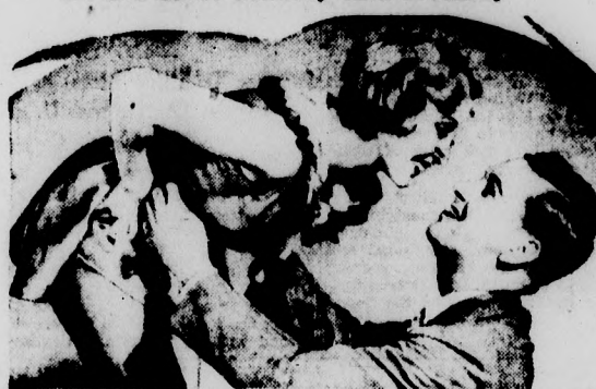
BESSIE LOVE and CHARLES KING in "CHASING RAINBOWS."