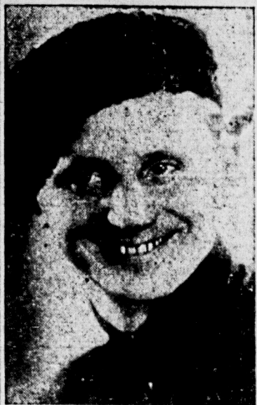
SERGE JAROFF conducts Cossacks