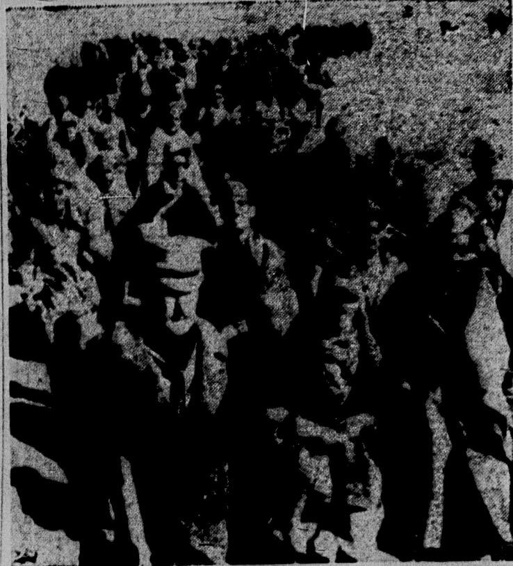
Italian and German soldiers, taken prisoner by Allied forces near Tripoli, march toward the rear. The prisoners have been separated, placing the Italians in front and Germans behind. This is an official British photo, sent by radio from Cairo to the U. S.