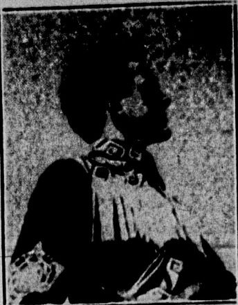
DANIEL MANNIX catches dragons with eagles.