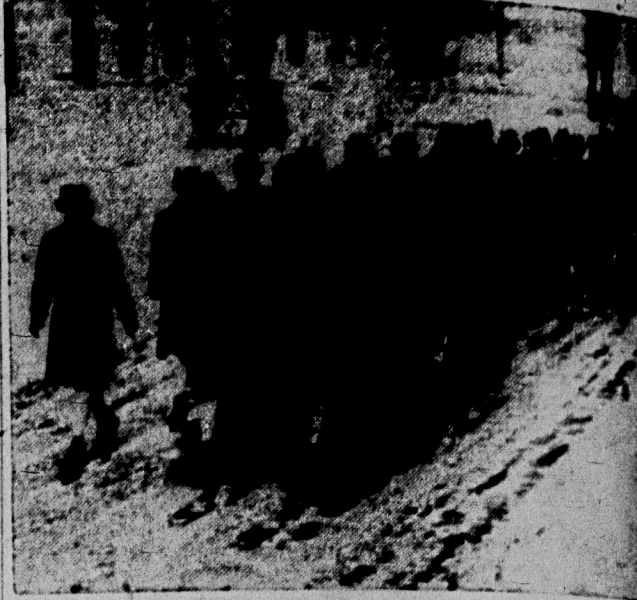
A group of WAACs under the command of their executive officer drill near Battle Creek. The first of the WAACs to take residence at Fort Custer, they turn out early in the morning for this drill.