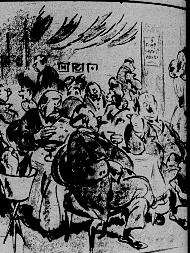
"Ha! Remember the old days when we had dine him to get an order? Now he's gotta to get his shipment out (411)