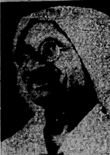
MOHANDAS GANDHI ... to end fast ...

POONA, India, Mar. 2 (AP)—Mohandas K. Gandhi planned tonight to end his 21-day hunger strike on schedule at 9 a. m. tomorrow (10:30 p. m., CWT, Tuesday) by drinking a glass of undiluted citrus juice.