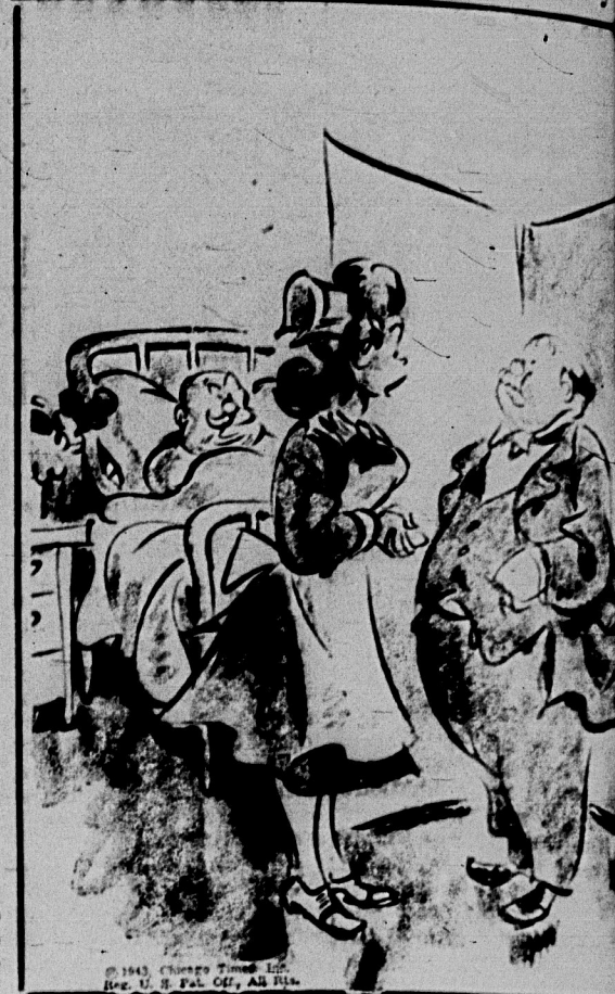
He's much improved today—he's stopped worrying about the shortage of doctors—now he's worrying about the age of nurses.