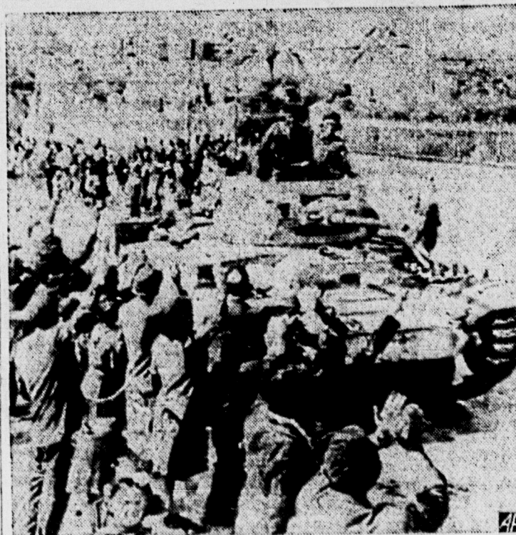
With waving arms and cheers, the population of Sfax lined the streets to welcome the British eighth army as it rolled through the Tunisian port on Rommel's heels. Two British Tommies grin their appreciation from the tank turret.