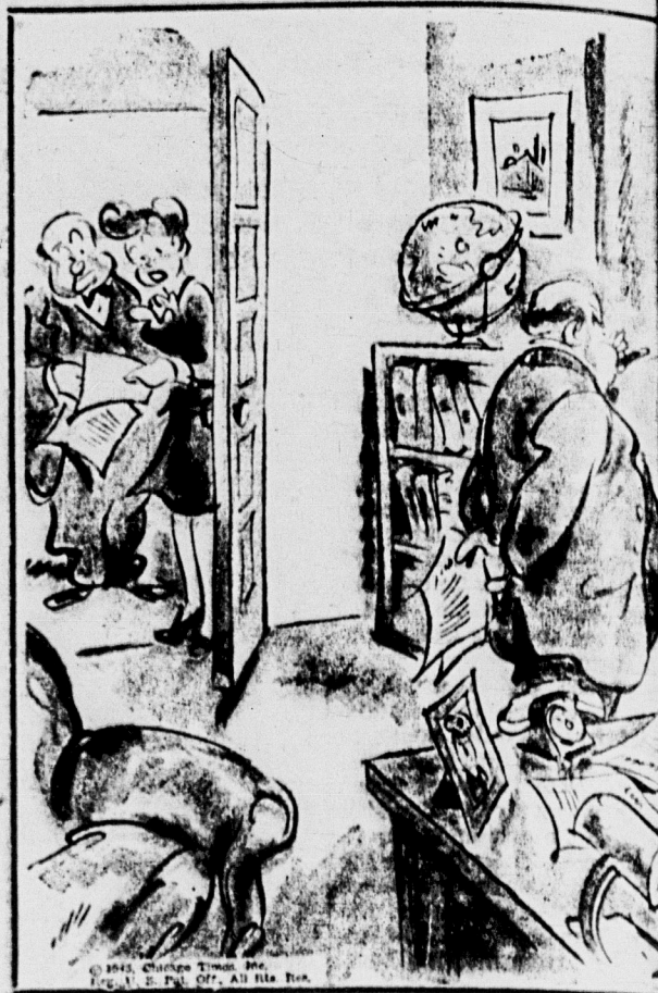
"I only hope it's not rabbits in his 'victory garden.' Last time it happened, he wouldn't sign a letter or caller all day!"