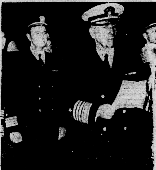
Adm. ROYAL E. INGERSOLL, former commander-in-chief of the Atlantic fleet, reads his orders naming him commander of the Western Sea frontier as he took over his new command aboard his flagship at the Navy yard in Washington, D. C.