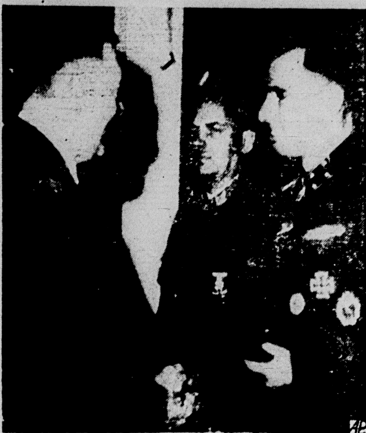
The most recent picture of ADOLPH HITLER to reach Stockholm, the caption of this German photo serviced by the Swedish picture agency Pressens Bild described is as the Fuehrer (left), at his headquarters Sept. 25, greeting LEON DEGRELLE, (right) Belgian Rexist leader who received the Knight's cross to Iron Cross. Man at center was not identified.