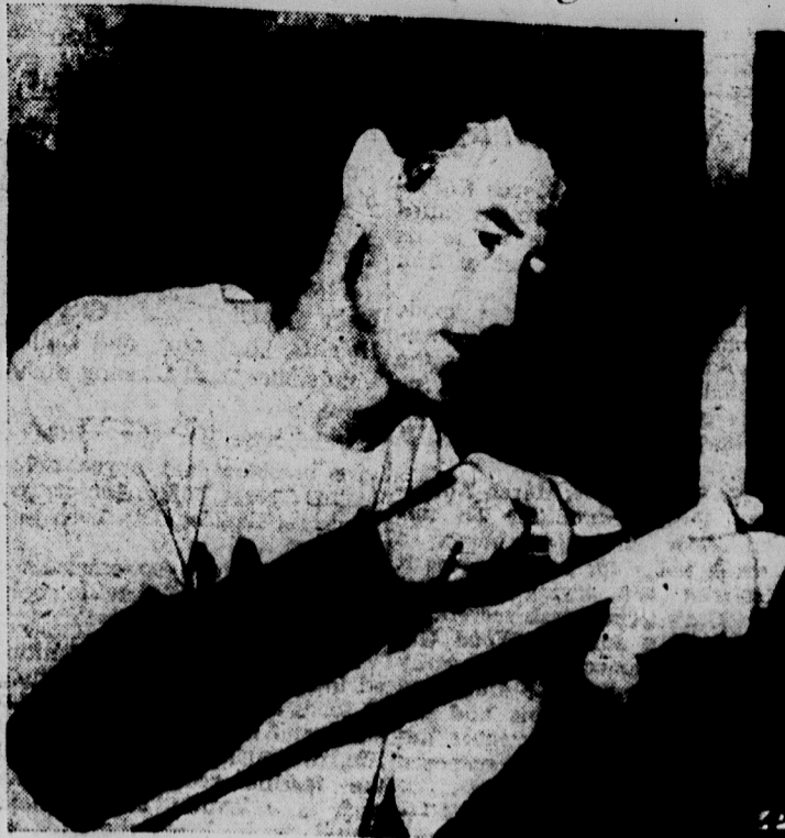
Back in the baseball fold after shedding navy blues is TED WILLIAMS, slugging star of the Boston Red Sox who gives the Bean Towners a list of very potent sluggers. Ted, shown above honing the handle of his favorite bat, will be swinging at the fences along with Rudy York, Dom DiMaggio, Bobby Doerr, and Bill Tabor.