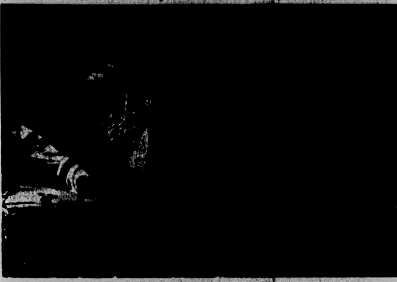
This is the remains of the 1941 Mercury coupe that piled into a tree early yesterday morning, killing two State students and critically injuring another. The wrecked automobile is on display on the Capitol lawn.