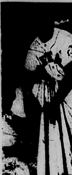
Larry Doby, first Negro in the American league, poses proudly in his Cleveland Indian uniform in the dugout at Comiskey Park in Chicago. In his debut with the Indians, Doby was signed by the tribe after being purchased from the Newark Eagles of the Negro National league. Doby struck out in first appearance as a pinch-hitter Saturday, but singled and batted eight chances flawlessly at second against the White Sox Sunday.