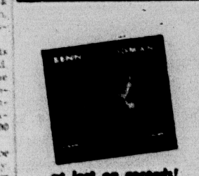
at least on records! the famous 1938 jazz concert BENNY GOODMAN