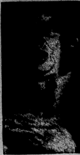
Sen. Owen Brewster (R-Me.) thumps his fist as he calls for the use of the atomic bomb against the Chinese communists attacking U.N. forces in Korea.