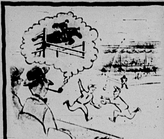
Look! Another man switched to Kentucky Club—the thoroughbred of pipe tobaccos