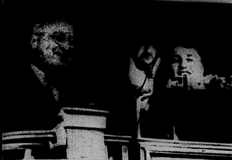
President Truman arrived in Lansing with his daughter, Margaret, at the C & O station and was greeted by a crowd of about 5,000 persons. He is campaigning for Stevenson in Michigan.