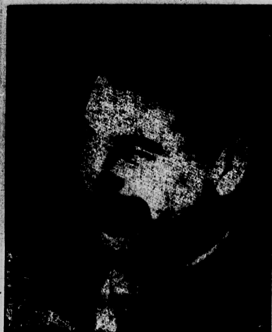
JOSEPH V. STALIN

The people stood, too, at newstands for the latest news of their leader's condition. Otherwise life in the capital went on normally.