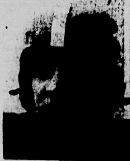
ROLAND DOTSCH, stocky tackle