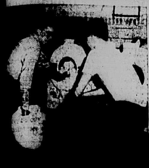
Mondays don't seem to get MSC men down with machines right close to laundry bags.