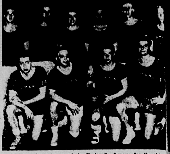
Sigma Nu, winners of the Fraternity League for the third straight year, advanced to the finals of the All-College 'mural' Basketball League by defeating Butterfield 3, 29-16.