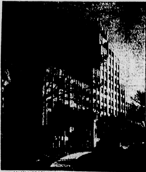
ADMINISTRATION BUILDING—A. E. STALEY MFG. CO.

ATTENTION Seniors in Commerce, Chemistry, Chemical Engineering, Liberal Arts or Agriculture