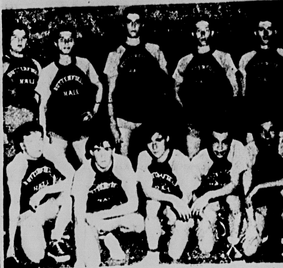
Butterfield 3, winners of the Dormitory League title, advanced as far as the semi-finals Wednesday night before falling to a stronger Sigma Nu team.