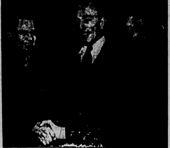
Secretary of Defense Charles E. Wilson (right), congratulates Robert B. Anderson (left), in Washington, Tuesday, shortly after President Eisenhower nominated Anderson, new secretary of the Navy, to become deputy secretary of defense as successor to Roger M. Kyes, (center). Kyes has resigned, effective May 1.