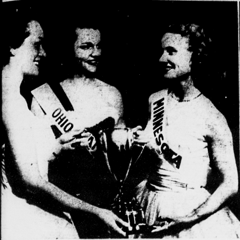
Miss Minnesota Receives the Big 10 Cup