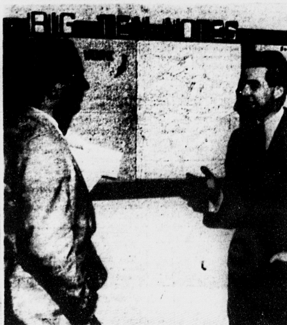
Big 10 Head Inspects Offices

"Structure Relaxation in Liquids" will be discussed by Mack A. Breazeale, a special graduate assistant in physics, at an ultrasonics seminar, Tuesday at 11 a.m. in 221 Physics-Math Building.