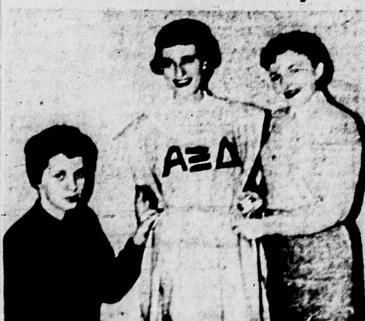
These are adjusted for Saturday's mock Olympia contest "Athena's Holiday," sponsored by Delta Gamma and Alpha Xi Delta sororities.