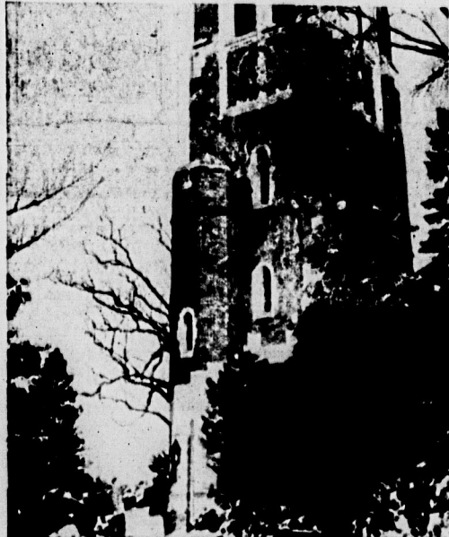
Two students question the hour as they compare watches with the Beaumont Tower clock. All four clock faces have been missing their hands for several days. According to the maintenance department, mechanical changes are being made.

Charles stated the post office closed Saturday from two to seven p.m. to make out preference bids prior to the issuing of bids. Each bid was marked the number for which the bid was made and would be willing to pay in the order of his preference. The houses likewise list the names in the same order. Paid workers compare the bids and when these are matched, the house issues formal invitation to pledge.