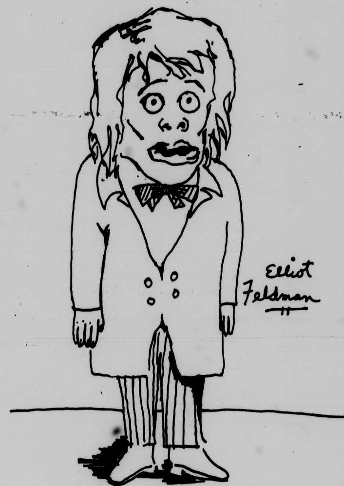
A Rolling Stone gathers no moss. Did you ever try to smoke moss?