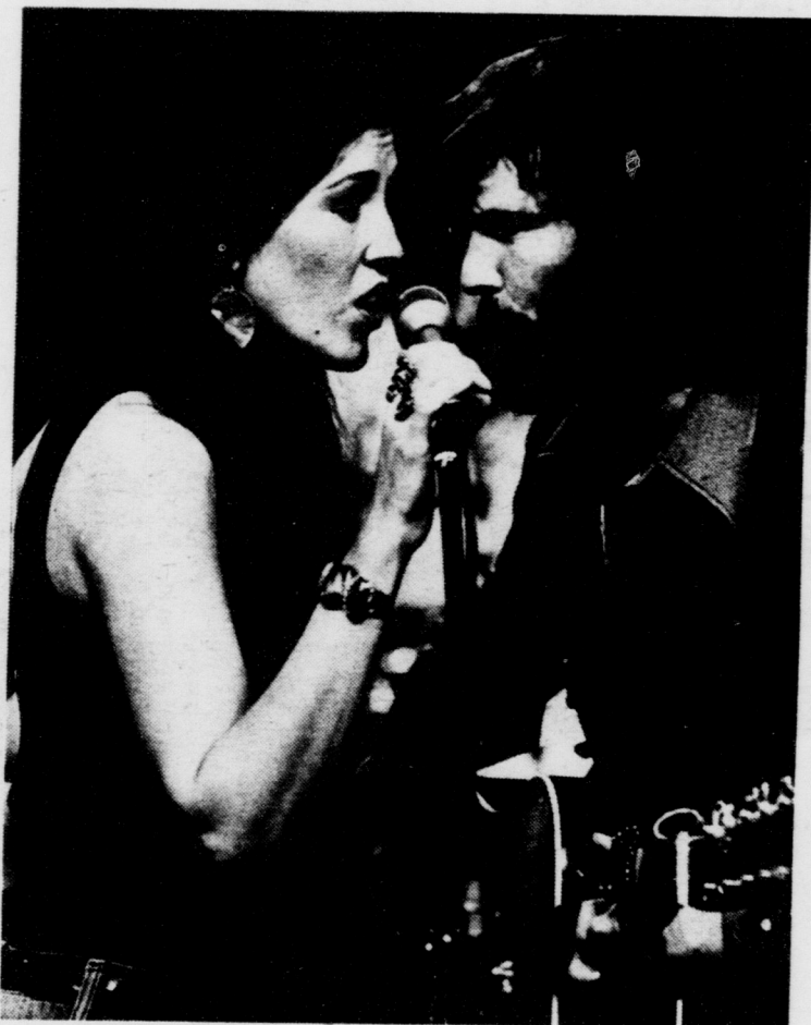
Rita Coolidge (left) joins song-writer musician Kris Kristofferson for the concluding program in the SOUND-STAGE series on PBS which can be seen locally Fri. 2-28 at 10 p.m. on Channel 23.

Rita Coolidge joins Kris Kristofferson on Channel 23