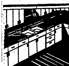
Kitchens Planned at