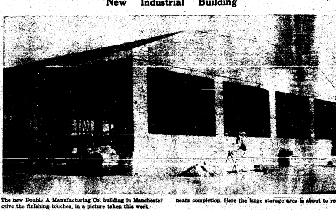
The new Double A Manufacturing Co. building in Manchester nears completion. Here the large storage area is about to receive the finishing touches...

MANCHESTER, MICHIGAN, THURSDAY, OCTOBER 21, 1954