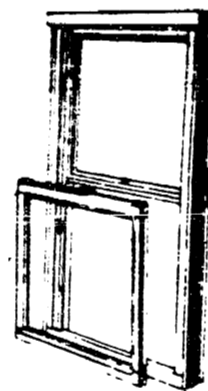
THE COLD STOPPER

Full 1 1/4" thick white crossbuck door with Purchase of 6 or more SUPER THERM PRIME REPLACEMENT WINDOWS