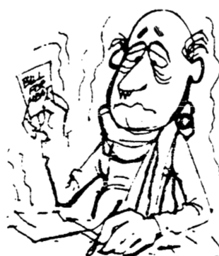
YOU KEEP PAYING HIGHER HEATING BILLS BUT YOUR HOUSE ISN'T GETTING ANY WARMER!

R.D. KLEINSCHMIDT, INC. HAS A FULL LINE OF HIGH QUALITY, LABORATORY TESTED, REPLACEMENT WINDOWS, COMBINATION STORMS AND SCREENS FOR YOUR WINDOWS AND DOORS.